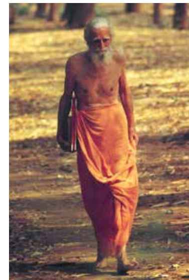
Bede Griffiths at Shantivanam in India