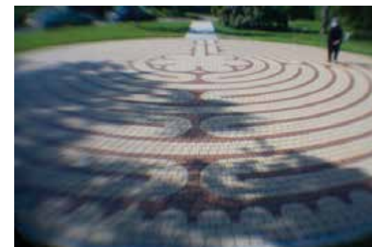
The beautiful outdoor labyrinth is open for meditative prayer each day.

A number of reasonably priced hotels are nearby, but none are walking distance to the retreat venue. Go to www.wccm-usa.org/upcoming-events/ to download a list of hotels.