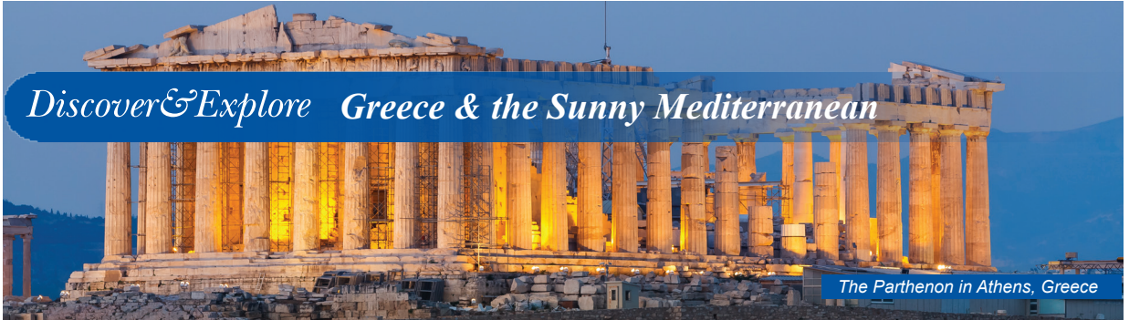
The Parthenon in Athens, Greece