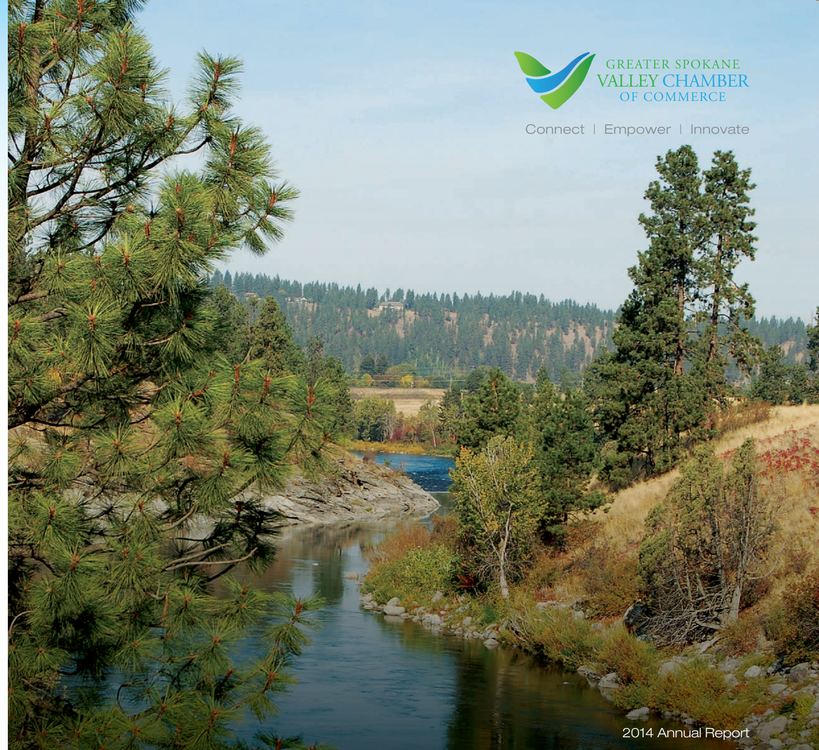
2014 Annual Report