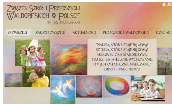
Webpage of Związek Szkół i Przedszkoli Waldorfskich w Polsce, the association of Waldorf schools and kindergartens in Poland www.zspwp.pl

And finally, we are making preparations for the next council meeting, which will take place April 20 - 24 in Krakow, Poland. This will be the first council meeting in Poland, and council members have also been invited to participate in a Polish kindergarten conference in Warsaw.