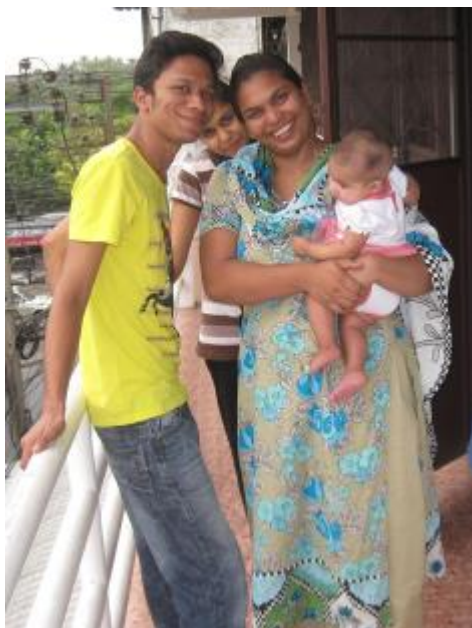
Being Refugees Has Not Stolen Their Joy