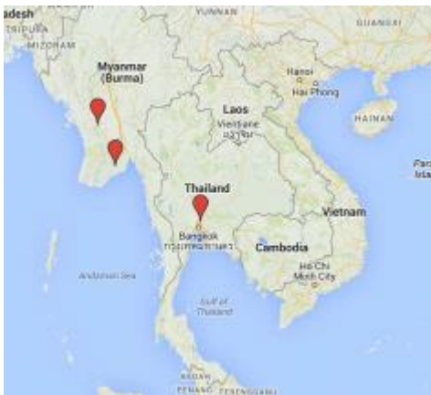
Mission Sites in Myanmar and Thailand

We stopped in briefly to visit and pray and to witness the advance of ministry. We were pleased to be part of a visit to a Pakistani refugee group in Bangkok and an outreach to children who live in a strip of slum shacks and have little chance of being able to attend school. Please pray for this small corner of God's Kingdom that is making a big difference in the lives of an international community.