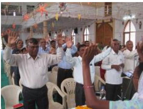
Participants Joined in Praising the Lord

Sunday services ranged from very traditional to more contemporary but always gave the feeling of the gathering of a large, affectionate family. Church members said they were encouraged by visits from fellow Anglicans.