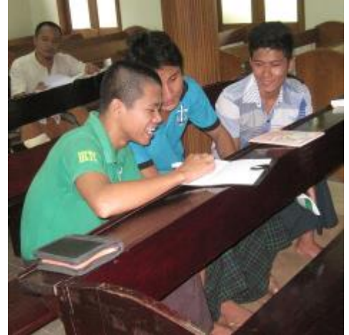
Students Worked Together in Small Groups