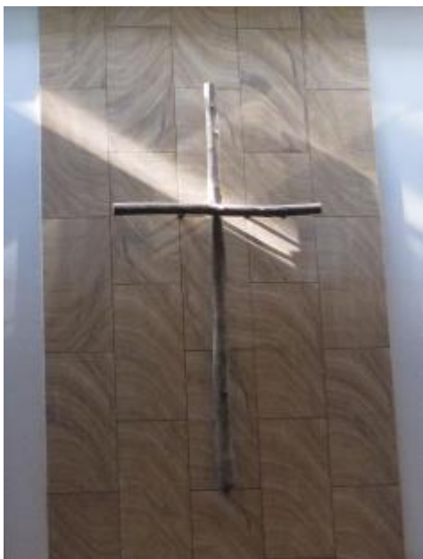
Cross Above the Altar at the Roundtable Site at St. Andrew's Cathedral, Singapore

The fourth Missions Consultation Roundtable with the theme of “That They May Know and Confess Jesus as Savior and Lord” brought together 150 mission partners, missionaries, diocesan staff and ministry leaders from nineteen nations to worship, inform and inspire. Half were from the Province of SE Asia. The hospitality was outstanding. One note about Singaporean leaders—we have observed that they often have three jobs. Priests often serve a mission deanery, a local Singaporean congregation and a ministry within the diocese. There is great ambition and energy for the Lord!