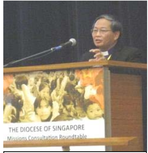
Archbishop Stephen of Myanmar

witnessed this first hand when we lived there in the early 80's. They have applied these same skills to mission. With heavy investment of funds and purchase of land they were guided to make strategic plans unique to each country and location. The Singaporeans reached out to make investments in education, campus ministry, schools, church plants, language centers and aid organizations. They sent missionaries, inspired Singapore congregations to partner and recruited other international Anglican partners. All of this was prayer driven and undergirded with a deep patience, investing in the future, inspired by very small percentages of growth.