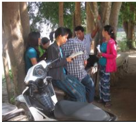
Small Groups Worked Outside Above the River

During the ministry time we experienced the very powerful presence of the Holy Spirit as we prayed for a fresh infilling. Many were touched. The following morning they reported feeling peace, warmth and the strong presence of the Lord.