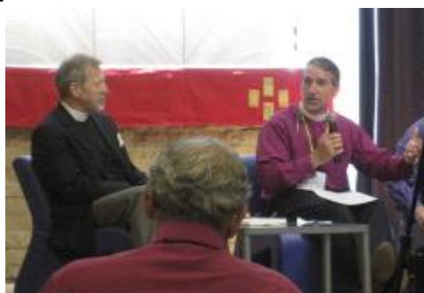
ACNA Archbishop Foley Beach Contributes in a Panel Discussion

Singaporeans are brilliant in business, building and education. We