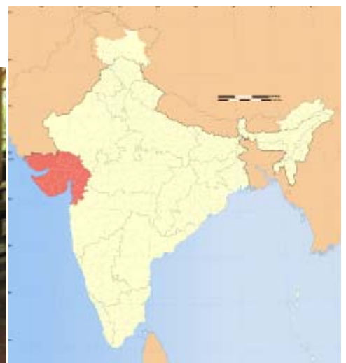
State of Gujarat, India