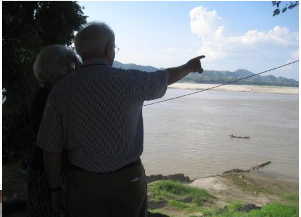
Myanmar is a Vast Country Now Open to be Claimed for the Gospel

St Mark’s Church sits on a high bluff overlooking the Irrawaddy River, a site chosen by early missionaries. It is an impressive position on this busy