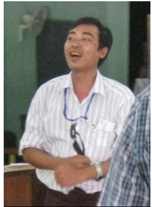
Each Session Began by Singing Praise

"I intend to teach my congregation all of these things."