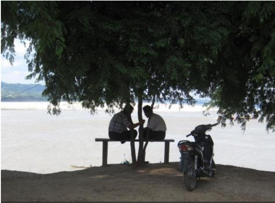
Participants Spent Quiet Time Praying for One Another