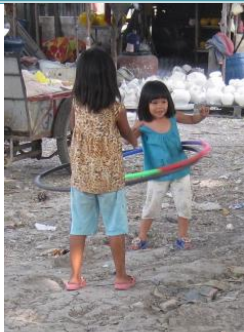
Kids in the Slum Find Joy in Play