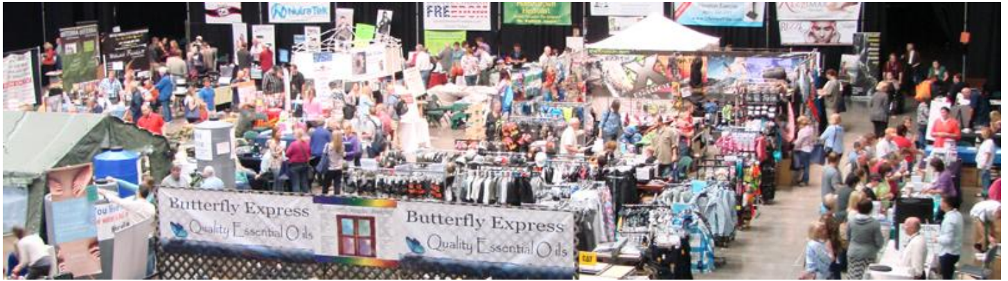
View of Previous Expo Main Vendor Area, Fall 2014