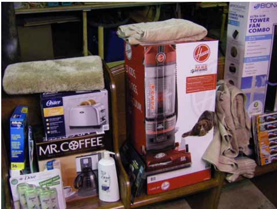
Just a few of the many items we donated to help a homeless person get a fresh start in a PADS apartment.