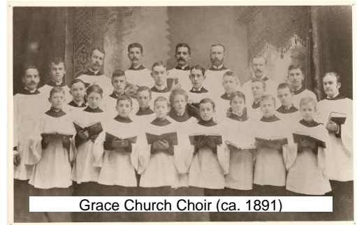
Grace Church Choir (ca. 1891)

The year 2014 saw the close of the 134 th and the beginning of the 135 th choral season of Grace Episcopal Church in Oak Park. Among the earliest photos extant of the congregation, we find ample evidence that choral music has been a priority here at Grace since the founding of the church. As Parish Musician, it is my life's honor to continue in that rich tradition.