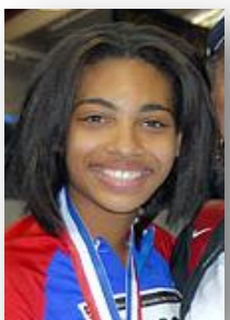
Class of 2012

*Currently a student and playing football at the University of Hawaii