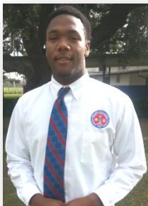
Class of 2015

"Here at Serra High I found a whole new family. Serra has taught me to care for others and not just myself. I am surrounded by many individuals that constantly challenge me to be a better person and student. Without the support of donors, students, and faculty none of this would have been possible. "