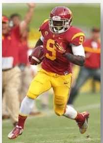
Class of 2010

*Currently a student and member of the track team at Duke University