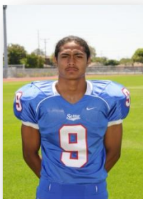
Class of 2013

"During the time I was recovering from my injuries, it was the support and prayers of the Serra family that enabled me to survive. My goal is to continue my education and become a positive contributor to society. Thank you for the opportunity to attend this High School, without your support, none of this would have been possible. "