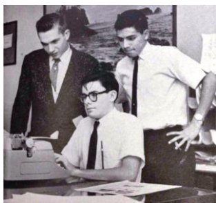
Serra Newspaper c.1963