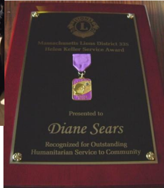
Newest Helen Keller Recipient