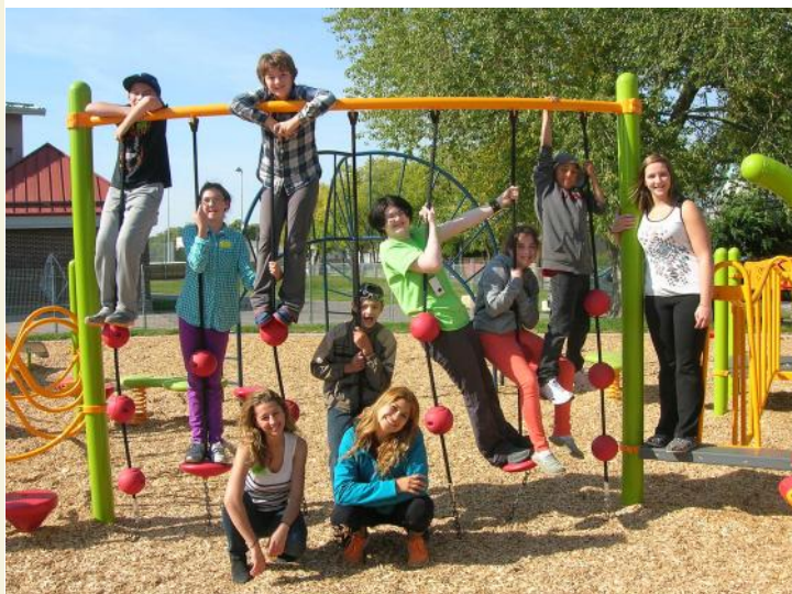
The group from SK and AB!