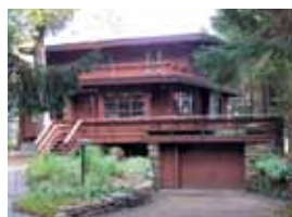
CLOCKWISE FROM LEFT: SCHWARTZ INTERIOR ; SCHWARTZ EXTERIOR ; SCHULZ HOUSE, WILLIAMSON HOUSE