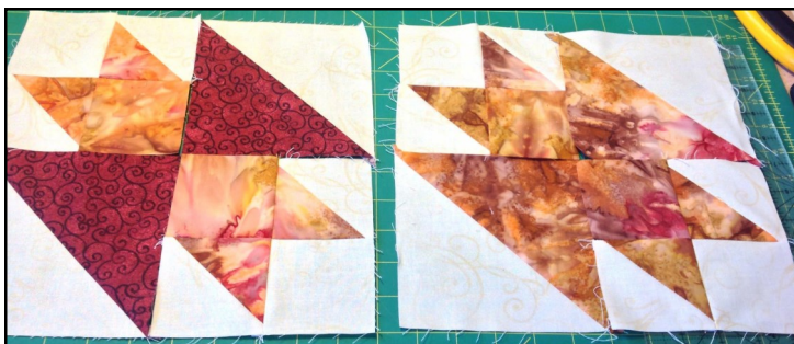
Figure 8, Linda G’s mix-matched unit & same-fabric unit.

AFTER YOU’VE CHOSEN YOUR FINAL LAY-OUT , you may want to add borders. The pattern suggests a 2-1/2” inner border plus a 5-1/2” outer border.