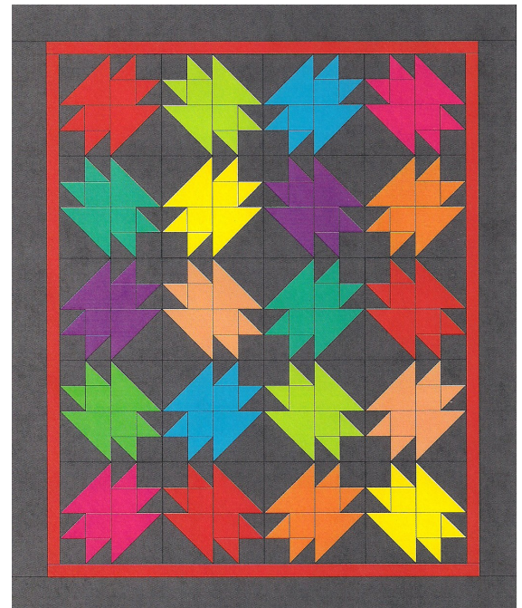
Mystery in the Blacksmith Shop (as the pattern suggests!)

AFTER YOU’VE CHOSEN YOUR FINAL LAY-OUT , you may want to add borders. The pattern suggests a 2-1/2” inner border plus a 5-1/2” outer border.