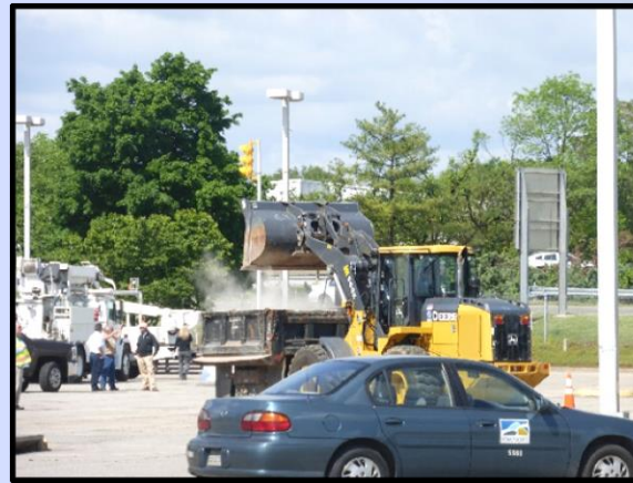
Front End Loader Course