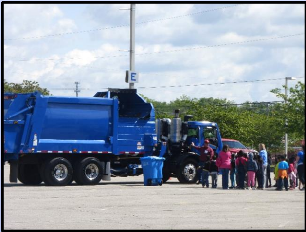
1 st Grader Students with an Up Close View!