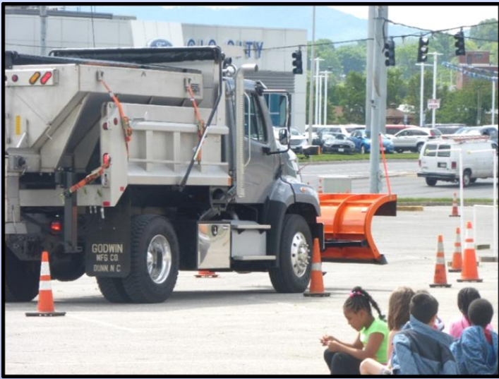
Snow Flow Obstacle Course, Sponsor Godwin