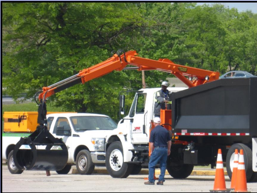
Knuckleboom, Sponsor: Virginia P.W. Equipment