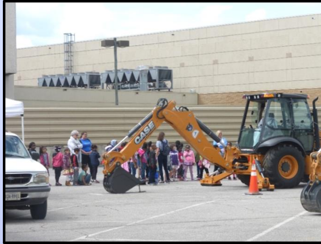
Backhoe Excavator, Sponsor: Lawrence Equipment