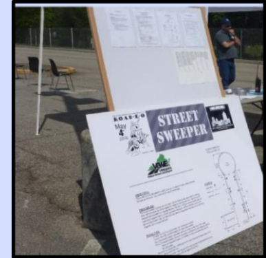
Street Sweeper Station, Sponsor: Virginia P.W. Equipment