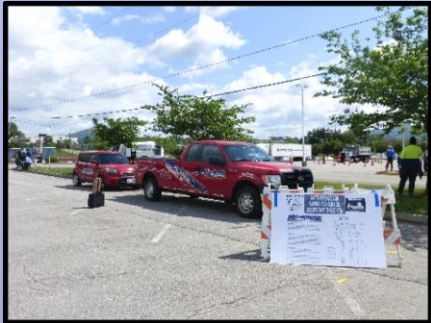
Solid Waste Packer Lift Station, Sponsor: Mid-Atlantic Waste