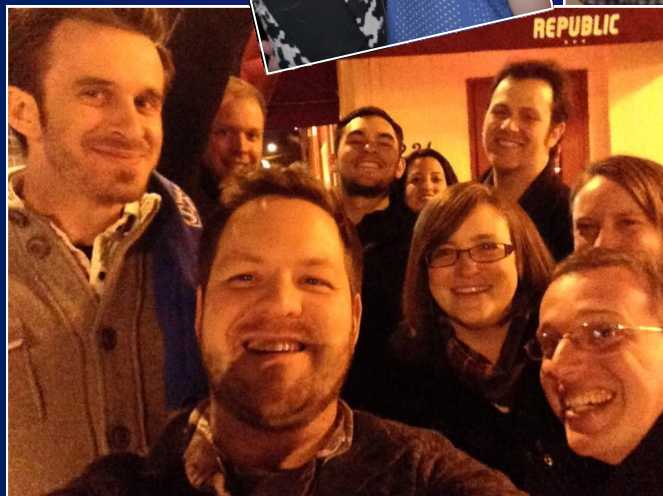
Above: The Class of 2004 celebrated their 10 year reunion on December 27, 2014.