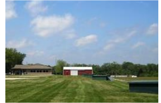
Jefferson Sportmen's Club – our host site for training...

Federal Migratory Waterfowl Stamp as required