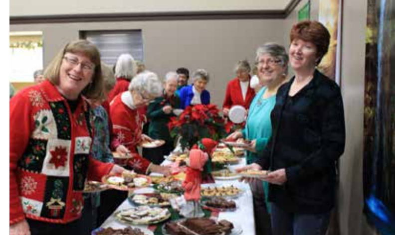
Above: Everyone loves the Women’s Tea. Center: A special skit from the Mary Circle. Bottom: Preparing for the Rummage Sale.

Nevertheless, although our group is not as large as it once was, it is very important to those still involved. We are truly like sisters and friends. We each meet in