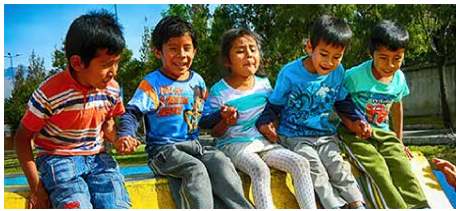
Some of the children from Niños con Valor in Bolivia