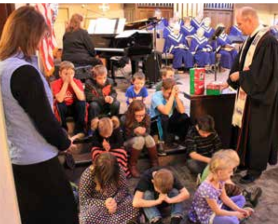
Photo Top: Recreating the manger scene. Left: Sunday morning Prayer Huddle.

Two new children's Sunday school classes began in Sept. An Early Childhood class for 3-5 year olds called the Preschool Pond at both 9:00 and 11:00. The curriculum consists of Songs, Prayers, Lessons At Sunday school and Home or SPLASH! and is based on traditional Children's Bible Stories. At 9:00 a special First Five Sunday school class for 1st & 2nd graders focuses on the Books of the Bible. Specifically the First Five books of the Old Testament one year and the First Five Books of the New Testament the second year.