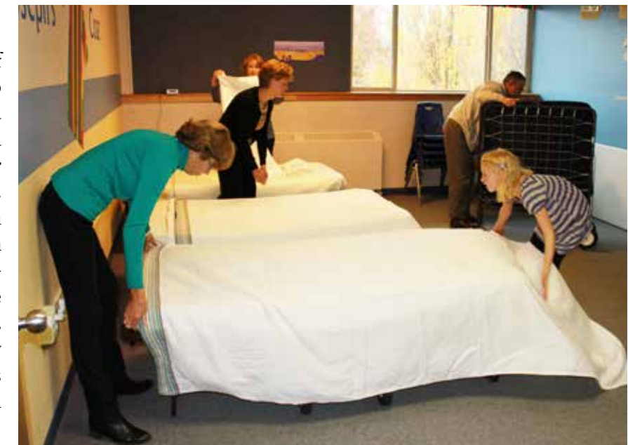
Below: Getting ready for the families requires a team effort.

as a volunteer for our church. They will offer you lots of support and encourage you as you spend an evening, provide food, or support service to others that are experiencing difficult times in their life. Please seriously consider how you can be involved in FPNI in 2015. Just as it is stated in James 1:22