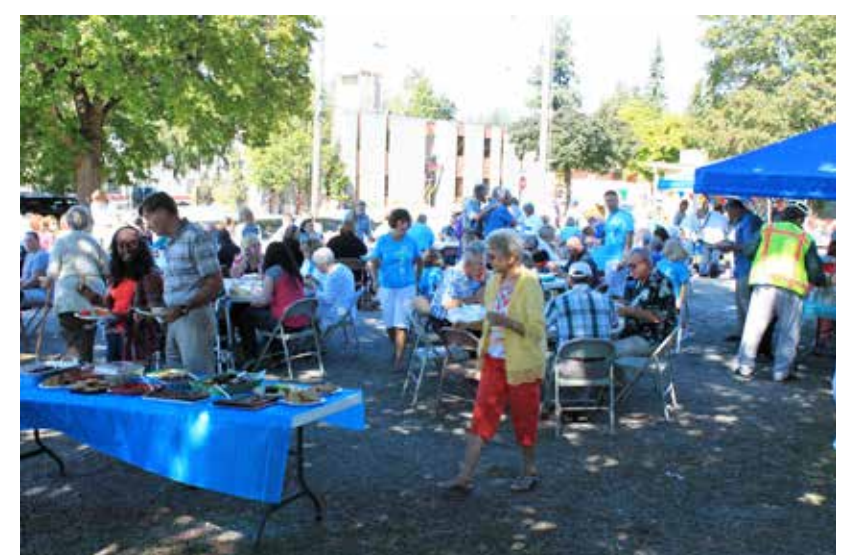
Clockwise from top left of spread: Cheering on the racers at Ironman; Parking Lot Palooza - featuring free fun & games; the jump castle at the Block Party, the dessert table at the Block Party; everyone in costume for Trunk-or-Treat.