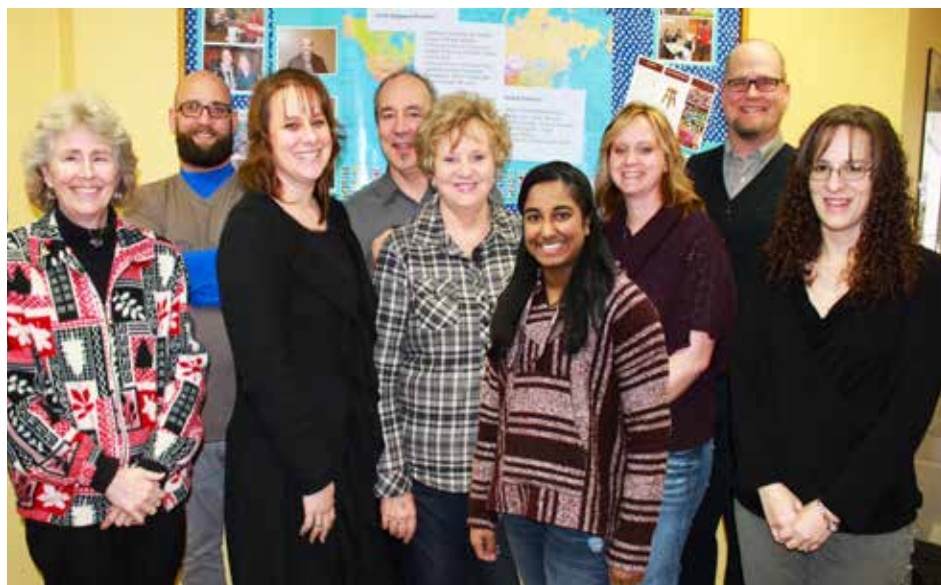
Above: Your amazing First Pres staff.