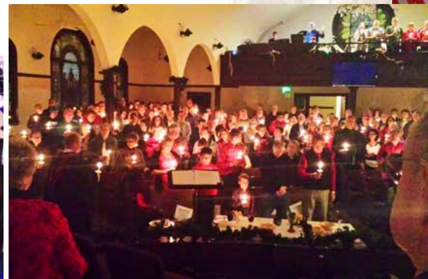
Photos, Top Right: Doctor Time shows Pastor how to operate the time machine. Bottom: Christmas Eve Candlelight Service.

encouraged the congregation to take a Bible if they needed one. When the sermon series was on "Hospitality" we used a display of pineapples in the Sanctuary. The pineapples were given to newcomers to welcome them.