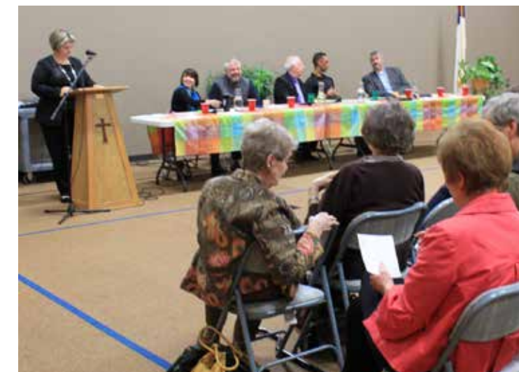
One of the panels hosted by the Dream Team.

In the coming months, the Dream Team will begin to develop a plan for the future using the information we’ve been gathering this fall. We are working hard to listen to understand the context of our church. We are discovering what is going on inside our church and