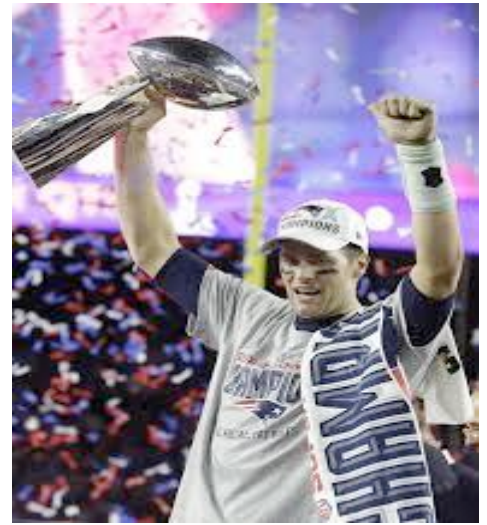
Tom Brady and the Patriots won the Super Bowl for the fourth time in the 2000's

Carroll said if they got the touchdown on that play it would be fine. If it was incomplete they would run it to Lynch on third and fourth down. Also, as NFL Prime Time pointed out that Marshawn Lynch was 1 for 5 on runs on the one-yard line. Congratulations to the New England Patriots for winning the Super Bowl.