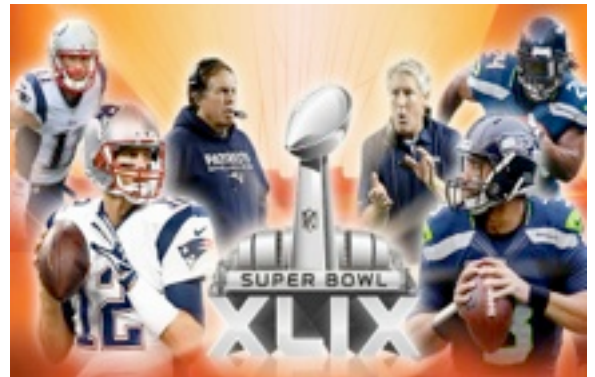
Everybody thought this year's Super Bowl was going to be a great game and it was!

The Seahawks had about 3 minutes to score. It looked like they would. After a couple of plays Wilson threw a jump ball to Jermaine Kerse. Kerse after bobbling it what felt like a thousand times he secured inside the ten yard line. Basically, it was a circus juggling act. After running it down to the one yard line things got confusing. Instead of running it to Marshawn Lynch they decided to throw it. It was picked off by by Malcolm Butler! The undrafted rookie out of West Alabama got his first pick of the season! Of course, it had to be in the Super Bowl. Tom Brady and the New England Patriots won Super Bowl XLIX! Of course, everybody was a bit confused. Why didn't Russell Wilson hand off the ball to Marshawn Lynch? Pete