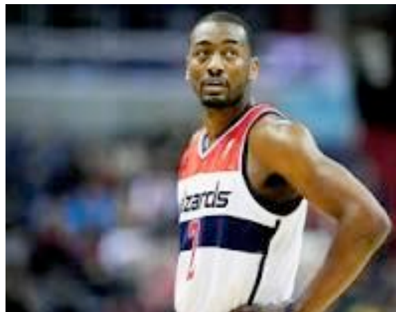
John Wall is having a career season.

The Wizards play LeBron James' team, the Cleveland Cavaliers, on Feb. 20, their first game after the All-Star break. The Wizards have an advantage because they have John Wall, Nenê, Gortat, and Bradley Beal. The Wizards are second in their division. Everybody wants Kevin Durant to come to the Wizards, so at the last couple of games people have been putting up signs saying KD come home. The starting five struggled the last couple of games before the break, but the bench is deep. Let's hope after this All-Star break that the Wizards will be unstoppable again!