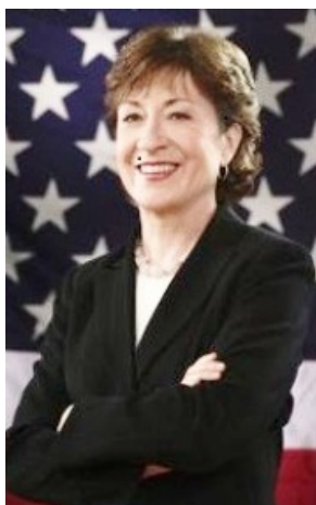
Sen. Susan Collins-R