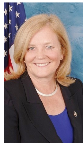
Rep. Chellie Pingree-D