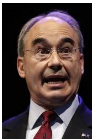
Rep. Bruce Poliquin-R