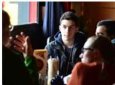
Deep in Discussion