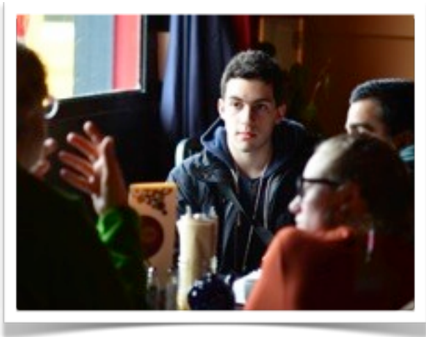
The Hub - Seminar Presentations and group work with mentors, evening lounge and Rotary sponsored lunch