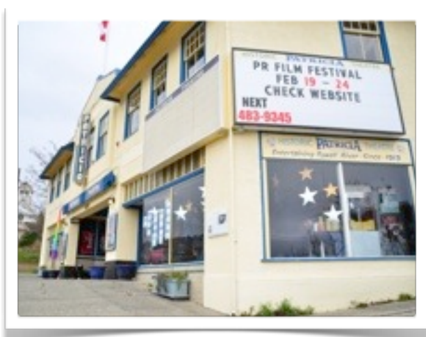
Historic Patricia Theatre: Film Festival venue, 5-Minute Film Contest Awards and 1-minute Adventures in Film students' final presentations