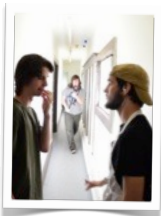
Behind the Scenes 2