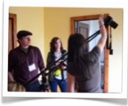
Filming in the Rodmay