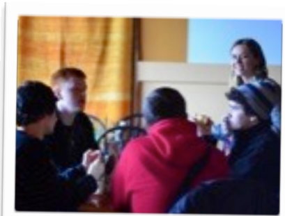
Group work at The Hub