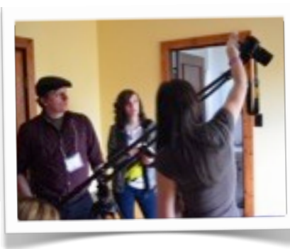
Setting up the Shot