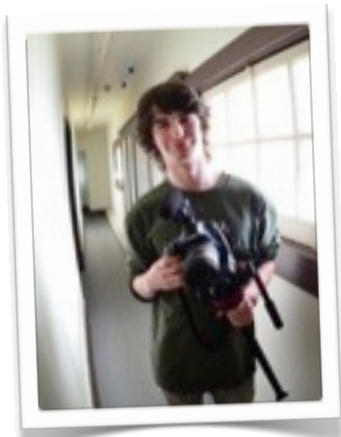
Behind the scenes