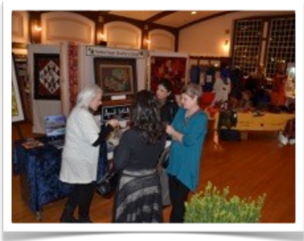
Historic Dwight Hall - Day Youth Lounge, Arts Mosaic, Receptions and Community Events