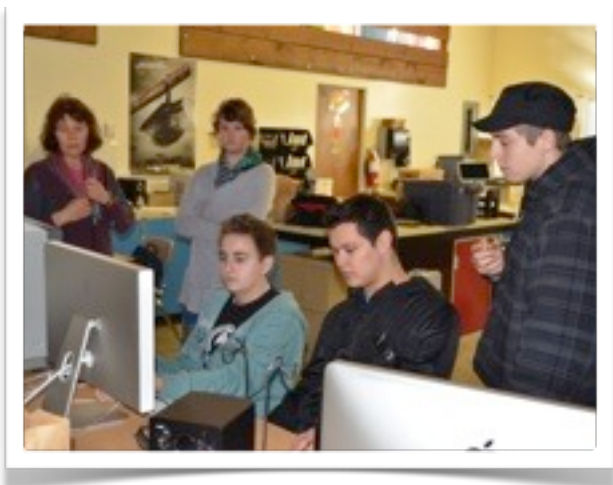
Oceanview Education Center: Editing suite, audio and graphic design workshops, post-production, staff meeting room