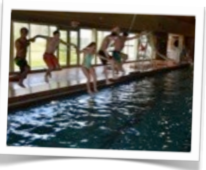
Well-deserved fun at the Pool