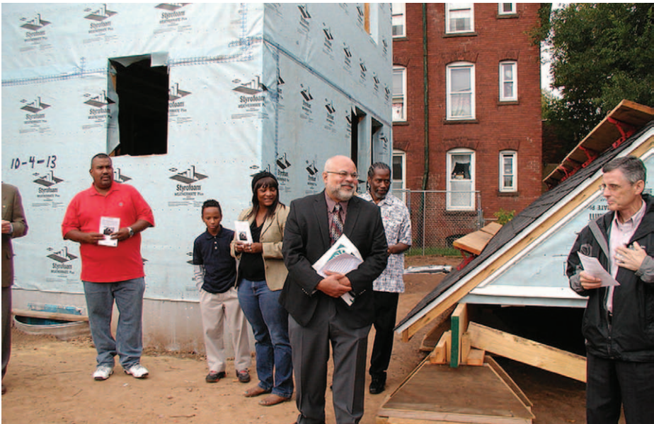
SINA at work

Granny's Pie Factory Kainen, Escalera & McHale, PC KJR Consulting Partnership for Strong Communities Premier Accounting Group Special Projects The Walker Group Twinbrook Insurance Whittlesey & Hadley, P.C.