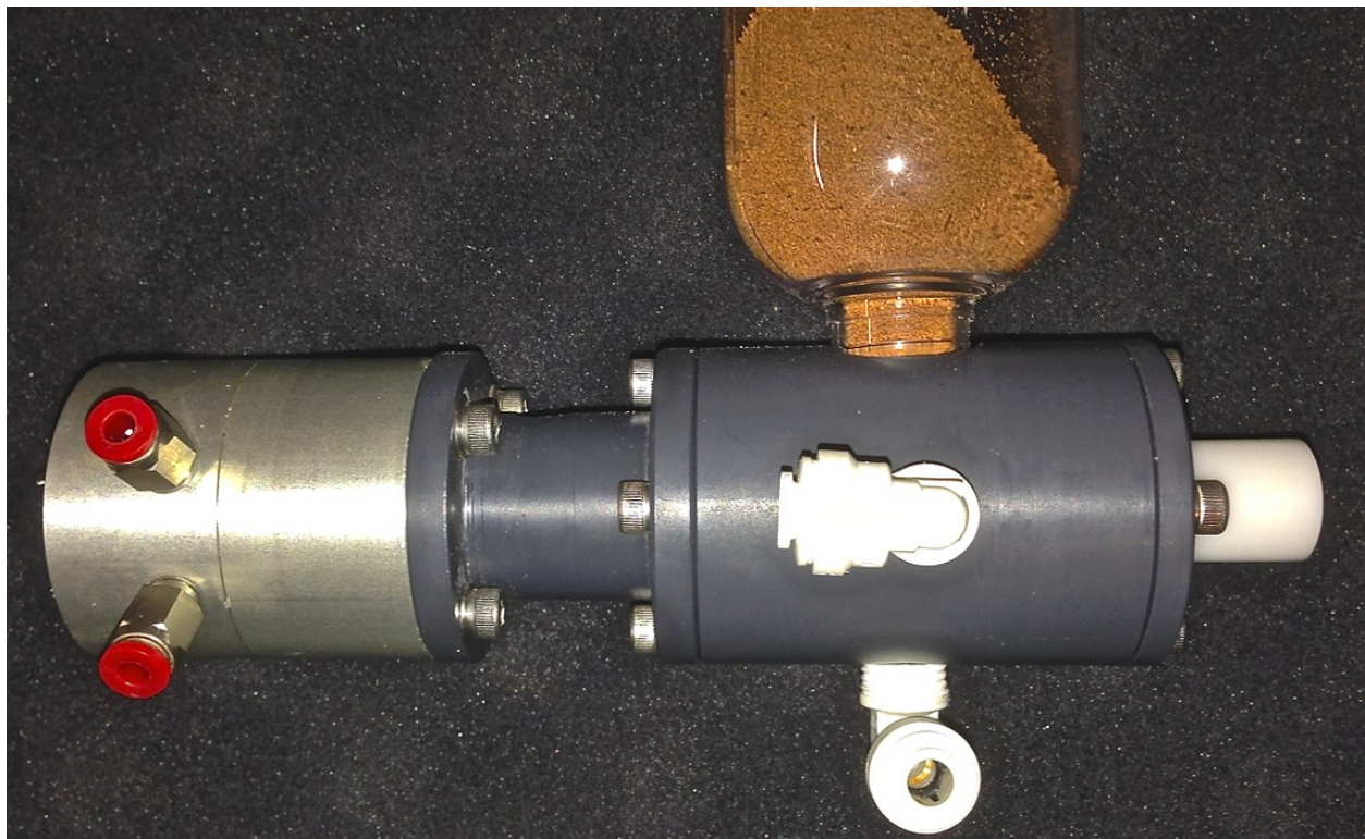
Pneumatically operated feed dispenser unit, including gravity fed hopper.

To learn more about the NOAA Fisheries Service , the Northwest Fisheries Science Center and Office of Aquaculture , please visit their websites.