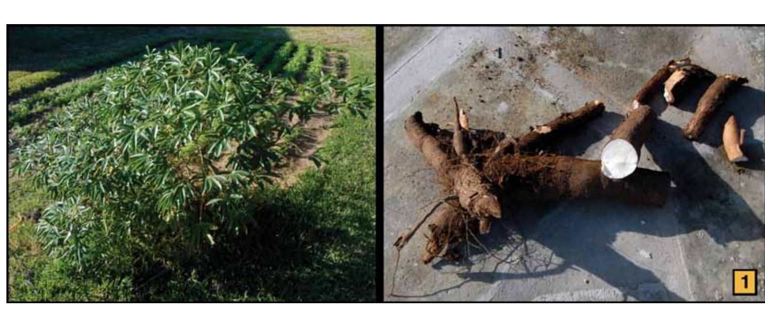
The foliage of a cassava plant and its root, after two years.