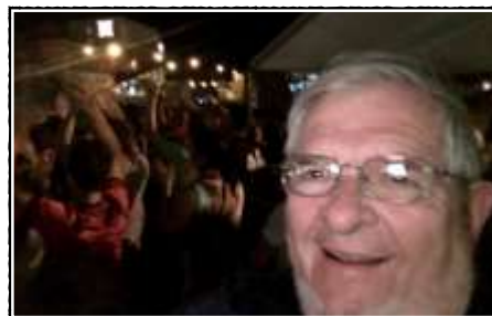
Arrived in the City of Braga (the build site) in time to share the celebration of Portugal's winning the European Soccer Championship for the first time. They were not expected to win, and they lost their star player, Raynaldo to injury early in the game. They won in overtime and it was bedlam in the streets.

Piety is stronger in the north.. An estimated 70 percent of Portuguese women are named Maria.