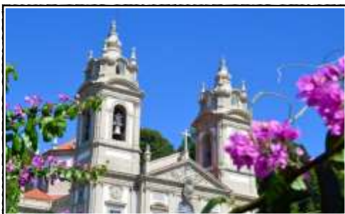
Portugal has lots of old churches with 95 percent being Roman Catholic.

Piety is stronger in the north.. An estimated 70 percent of Portuguese women are named Maria.