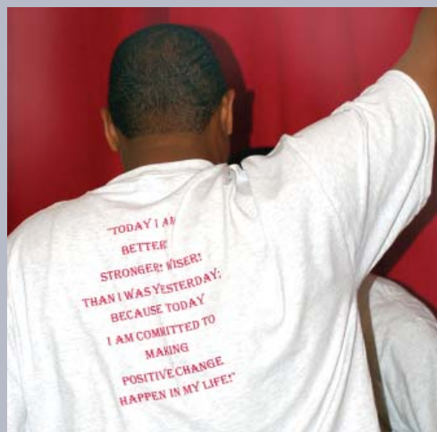
Arches motto affirmed by mentees at the beginning of each meeting

Arches continued from page 8 professionalism and dedication.