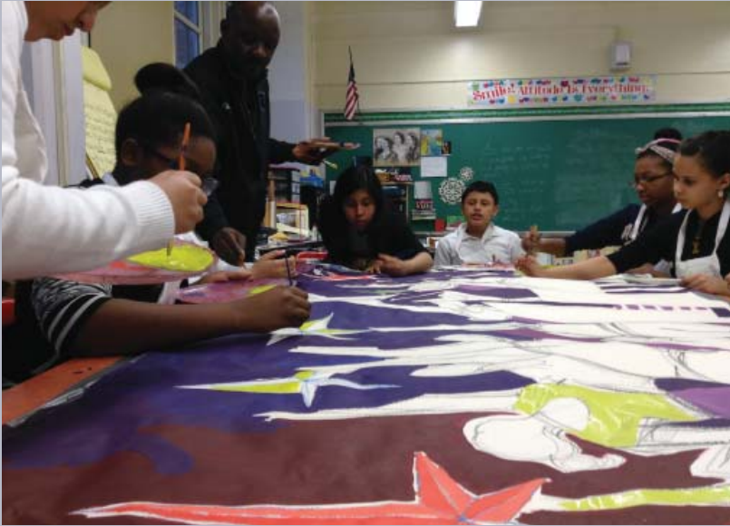
ABOVE students work on the template for a mural they will paint on the walls of their school

In 2014, Harlem Commonwealth Council, Inc. signed a $1,176,000 contract with the mayor's new afterschool initiative for middle school partnerships managed by NYC Department of Youth and Community Development (DYCD). HCC partnered with PS/MS 129, a K-8th grade school to operate a Schools Out NYC program (SONYC).