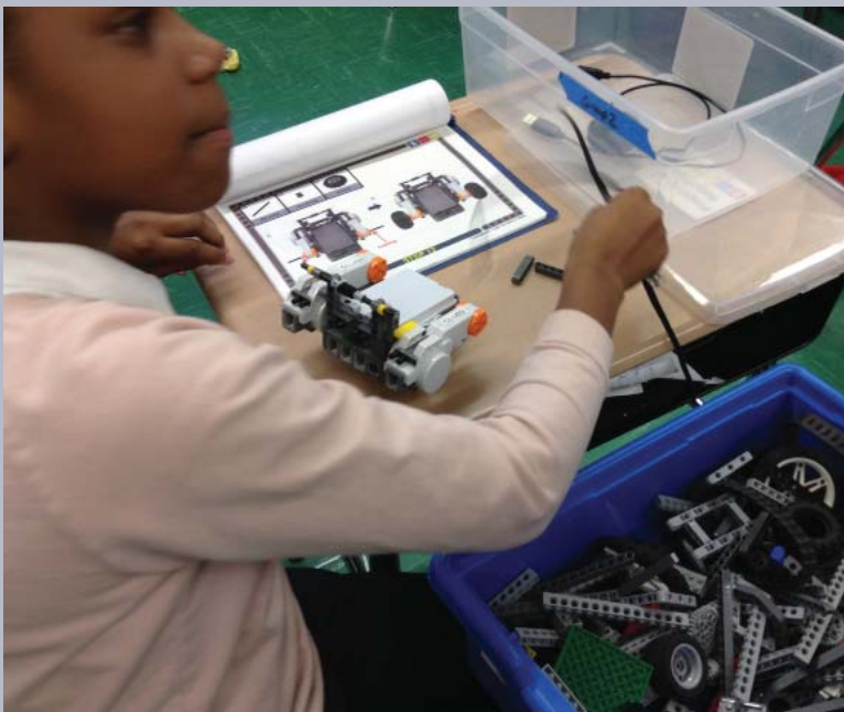
ABOVE student engaged in a robot building & experimentation activity

Presently, HCC's SONYC school-based program serves 90 youth and families and offers structured activities to grades 6, 7, and 8 in the arenas of Arts, Dance, STEM-focused projects (Science Technology, Engineering, and Math), academic enrichment, leadership development, recreation, spoken word poetry/creative writing , and other activities.