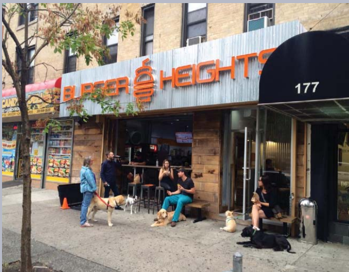
Located at 177 Wadsworth Avenue Burger Heights met an underserved demand and bustles with visitors