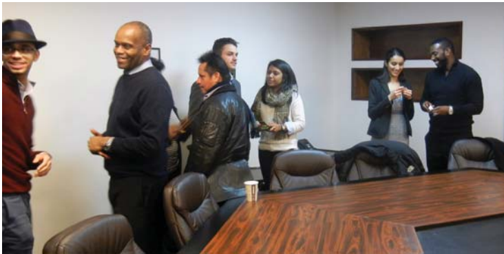
LEFT Local small business owners mingle and recap following the discussion