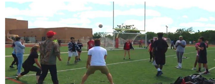
North High School students play volleyball during the many activities at the school's annual Water Fest.

Selected seniors were recognized during the Tower Royalty celebration. Five girls and boys were nominated by their teachers for the honor based on their contributions to their school during their four years at North.