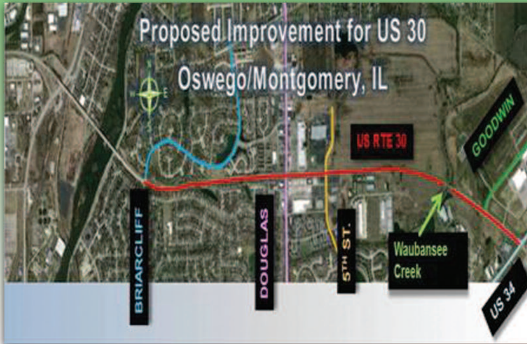
Contract #60I32: From Briarcliff Road to US Route 34