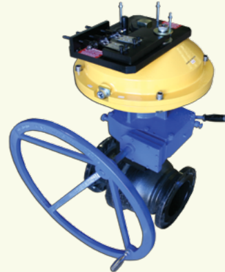
The BT fusible link assembly incorporates a declutchable gear operator to normally operate the valve after disarming.