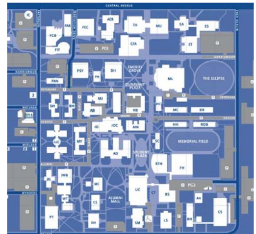
[click on map to go to the UM version]

In addition, comfortable accomodations are available in the University's on-campus residence hall Richardson Towers. All prices include linens: