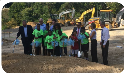
Berks · Fire · Water Restorations, Inc. SM is proud to donate all plumbing installation to the Olivet Boys & Girls Club Pendora Park Project .