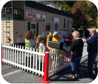
Berks · Fire · Water Restorations was proud to participate in the Mifflin Area Fire Safety Event.