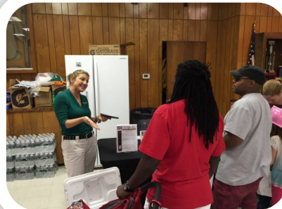
Berks · Fire · Water Restorations, Inc. SM participated in several Fire Safety Events in our coverage area for October's Fire Prevention Month .