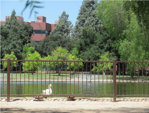
Above: Our ducks on the Fourth of July in their new home in a nearby park.

On a sweltering July day, HSRC volunteers and San Fernando Valley Audubon Society volunteers helped catch and relocate three flightless ducks. It was no easy task - with at least 14 people involved in different points outside, while Sisters and other staff peeked out the windows of the Villa to laugh and watch the near misses as one by one the ducks outsmarted us for part of the day.