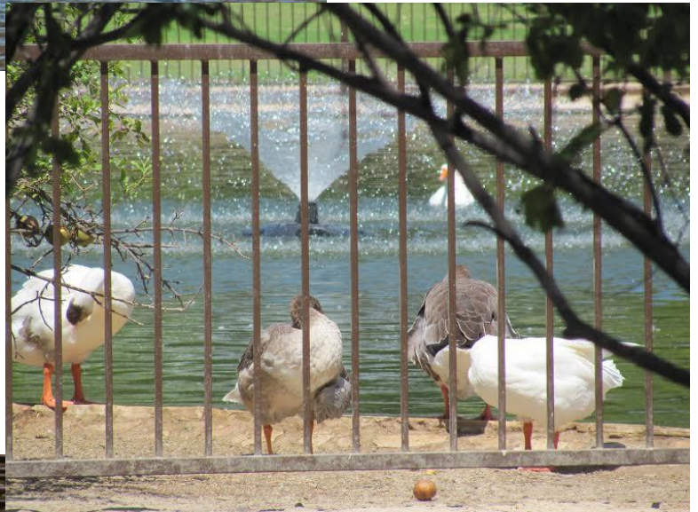
Right: Our ducks keeping cool on the Fourth of July!