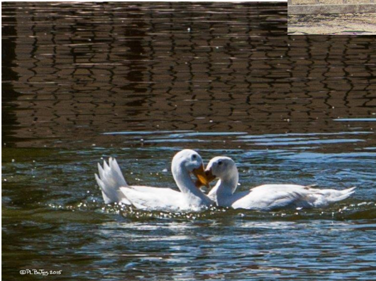
Left: Our spunkiest duck seems to have found a fine feathered friend.

Excerpt from our Sisters of Social Service E-news – August 2015