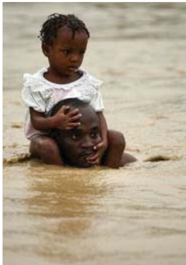
Port-au-Prince, Haiti.

"Examine what is offered to you as progress. We have to be alert if we are to defend this planet and live on it effectively. Regarding the environmental protection, concerns long ceased to be only for the present moment, because we also have a concern for future generations. We must draw conclusions from the limits and hazards of growth. We must not do all that we are capable of doing. Asceticism, self-restraint, self-denial has suddenly become fashionable again. These virtues are vital to man's survival." 17