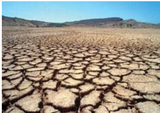
Popenguine, Senegal.

"Man is no longer the Creator's 'steward,' but an autonomous despot, who is finally beginning to understand that he must stop at the edge of the abyss." 5