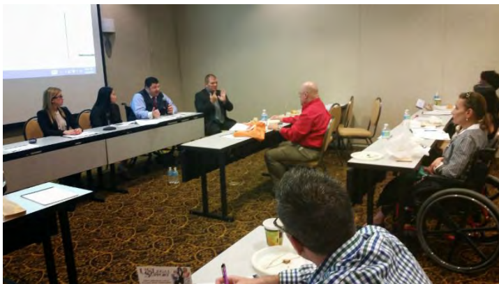
Panelists and participants at the inaugural Call to Action Diversity Summit in November 2014

Unfortunately, revenge porn is on the rise across the globe. It can damage nearly every aspect of a victim's life: relationships, career, social activities. In the most severe and tragic cases, it has even led to suicide ... Much needs to be done to address the problem. As a first step, we want to help put victims back in control of their images and their privacy. That's why Microsoft will remove links to photos and videos from search results in Bing, and remove access to the content itself when shared on OneDrive or Xbox Live, when we are notified by a victim.