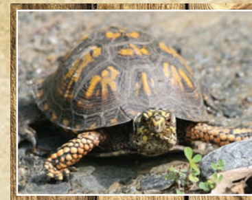
Eastern box turtle