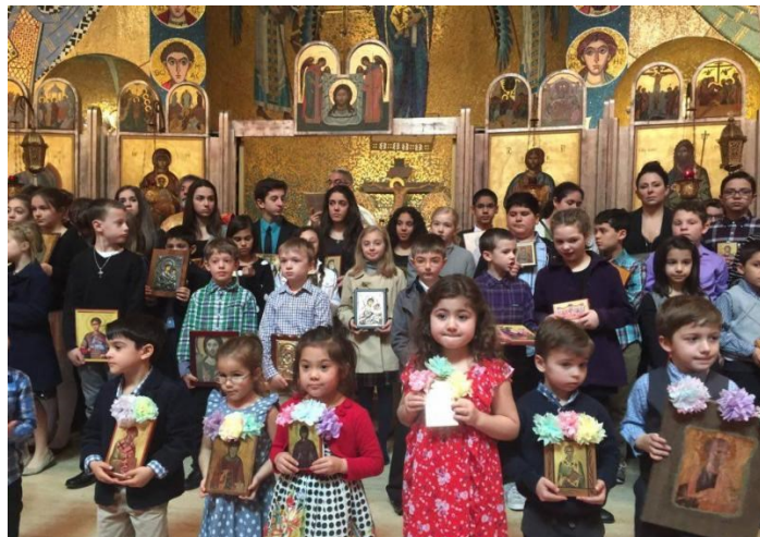
Our Sunday School Students processed around the church with Icons as we celebrated the Sunday of Orthodoxy on March 20.