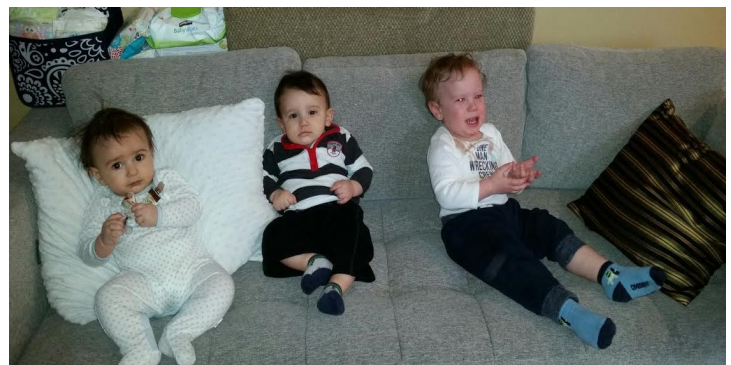
The "Gang" from March's Mommy and Me gathering