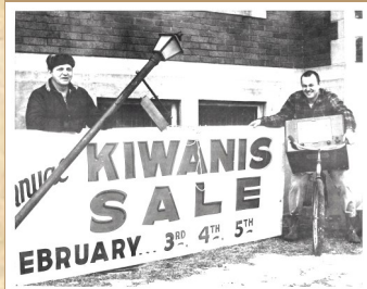
The Early Days

The Kiwanis Thrift Sale • Since 1927 • Over $3.5 Million in Community Service Funding • Thousands of Lives Touched