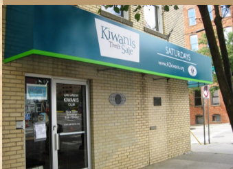
This is what we call HOME... now in our 94th year.