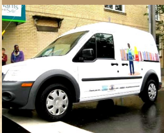
The Family Learning Institute "bookmobile" purchased with a grant from our club in 2014.