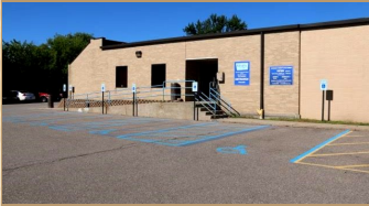
Kiwanis Center West