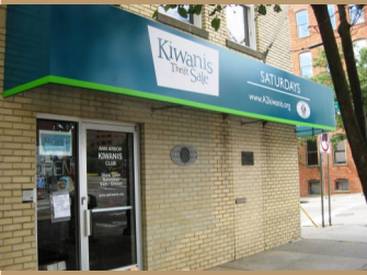
Kiwanis Center Downtown