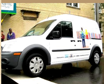
The Family Learning Institute "bookmobile" purchased with a grant from our club in 2014.