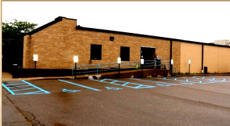
Kiwanis Center West

This is what we call HOME... now in our 94th year.