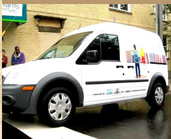
The Family Learning Institute "bookmobile" purchased with a grant from our club in 2014.