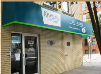
This is what we call HOME... now in our 94th year.