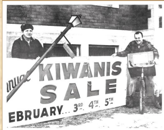
The Early Days