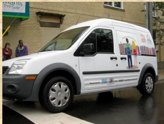
The FLI/CLN van will carry books and teaching materials to serve economically disadvantaged youth throughout Washtenaw County