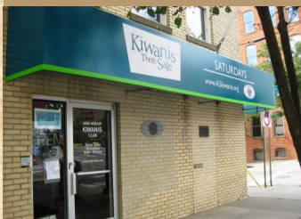
This is what we call HOME... now in our 94th year.