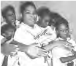
Youth in the summer leadership program wrote a play they performed at the end of the program.