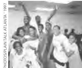
PHOTOSPLAIN TALK ATLANTA · 1997

Teens who participate in the Summer Youth Institute, shown here on the last day of the program, learn job skills, respect and more.