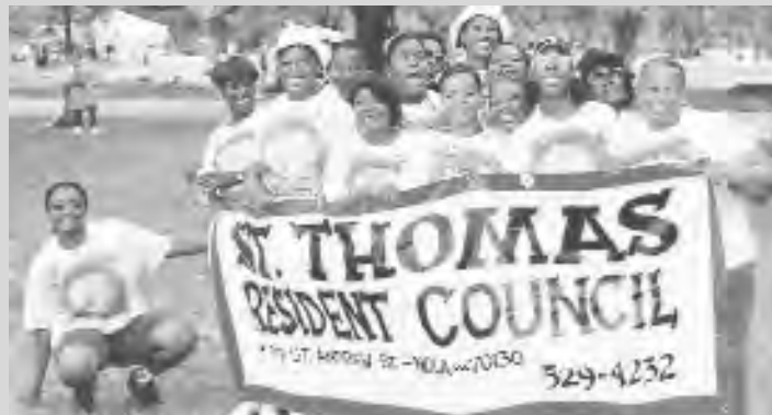
Plain Talk joins forces with established community groups, like this one in New Orleans.

This publication tells the story of Plain Talk. A companion publication, the Plain Talk Starter Kit, picks up where this one leaves off – illustrating how Plain Talk did what it did and sharing step-by-step instructions on how other communities can implement Plain Talk in their own neighborhoods.