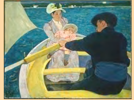
Painting by Mary Cassat