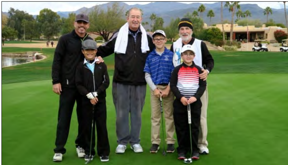
These 3 young men played 18 holes, all scoring under 80.