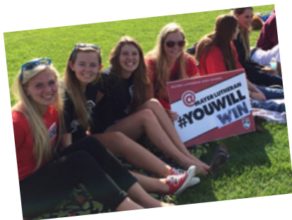
#YOUWILL Photo Contest! 4