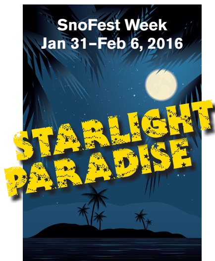
SnoFest details on back cover!

To submit information for publication in The Crusader , please contact Renae Johnson at rjohnson@lhsmayer.org or 952-657-2251. Materials due by the 14th of each month prior to publication.