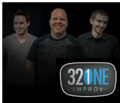
MLHS Celebrates Lutheran Schools 3

305 FIFTH STREET NE MAYER, MN 55360 952-657-2251 www.mayerlutheran.org