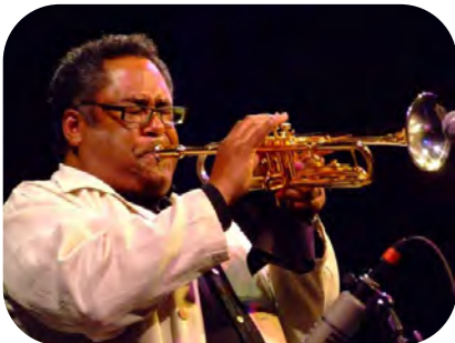
Visiting Clinicians: To Be Announced