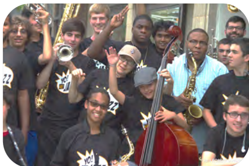
Academy students ham it up at a previous summer camp session.

Students will be required to perform in Showcase Concerts to be held during Jazz in the Park on Thursday evening July 28 th and the Summer Jazz Café series at Two River Theater on July 29 th AND 30 th at 8:00pm.