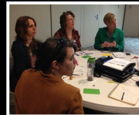
their cognitive OS.