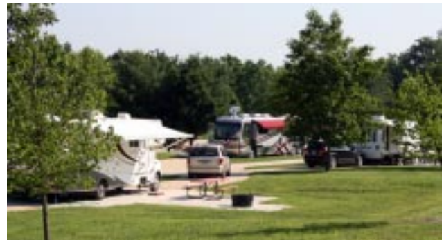
Recently opened A-Loop at Squaw Creek Park

The base camping fees in the new loop are: $22 for non-sewer sites and $25 for sewer sites. $5 per night will be added to this fee for reservations. Discount camping coupons are not accepted in the new camping loop.