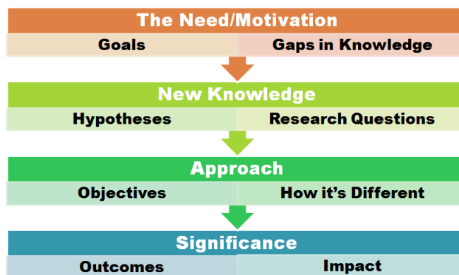
Figure 3. Use the first section to provide a cohesive story of your project.

This overview will explain, in no more than two pages, the story of your project (Figure 3).