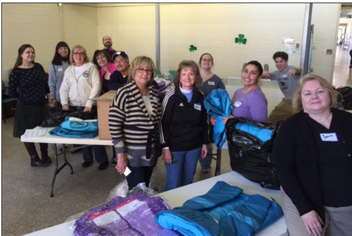
Thanks to Saint Joseph High School teachers and staff for volunteering at the Center on February 19. It was great to see "repeat" volunteers as well as new ones.