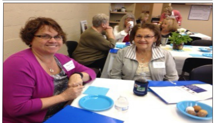
Twenty-seven guests attended the New Member Coffee on May 11.